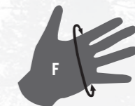
Measure your hand circuit (below the knuckles)