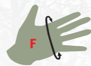
Measure your hand circuit (below the knuckles)